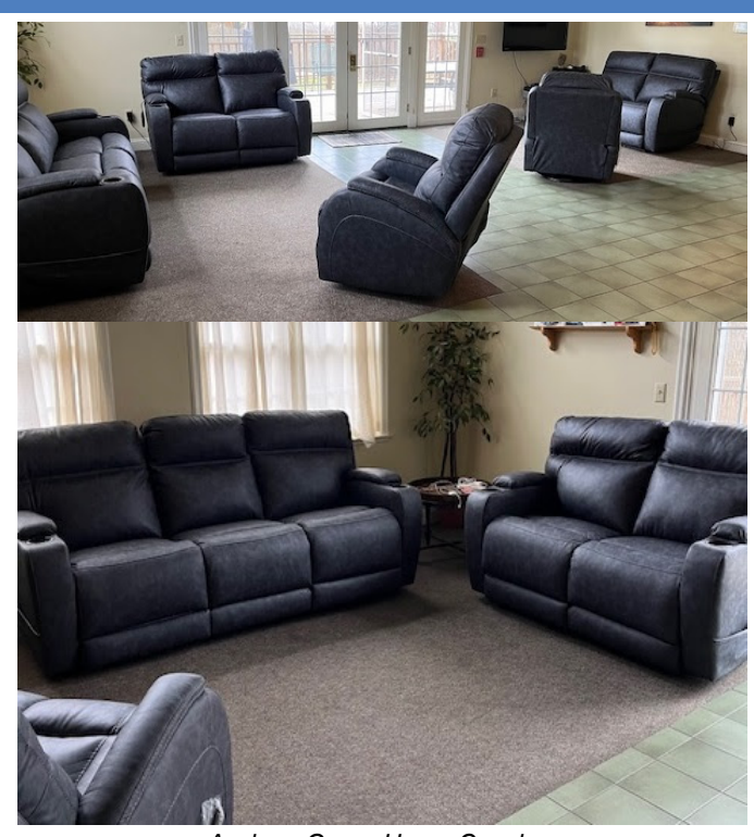
Asylum Group Home Couches

Harc's two group homes; Woodland and Asylum, have brand new furniture! Our individuals are so excited to max and relax on their new additions to their home. Families are thrilled that their loved ones are living in a space that is not only safe but comfortable.