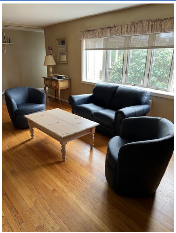
Woodland Group Home Couches