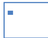
Calendar Date (1.37" x 1.44") Square