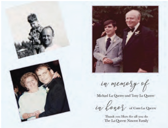
Full Page Ad