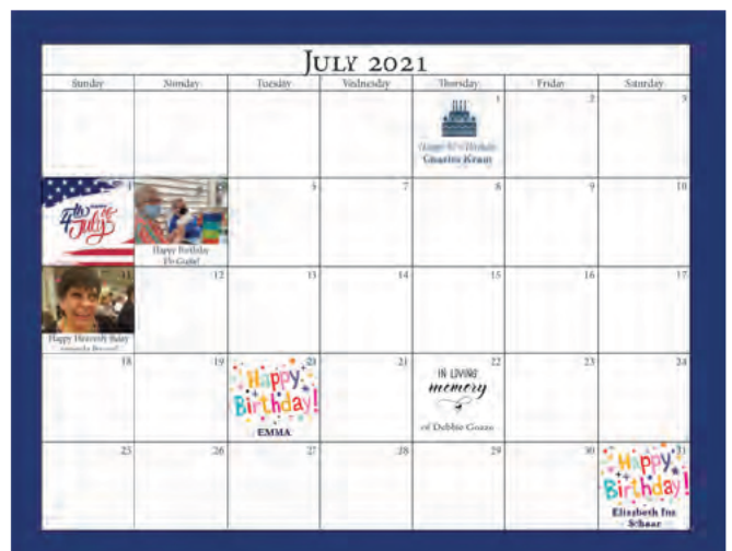
Calendar Dates & Calendar Dates with Photos