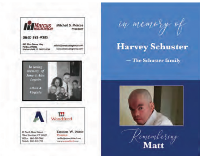
Business Cards & Quarter Page Ad