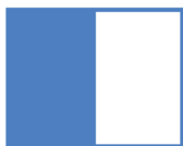
Half Page Ad (5.5" x 8.5") Portrait