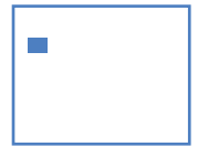
Calendar Date (1.37" x 1.44") Square