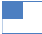
Quarter Page Ad (5.5" x 4.25") Landscape