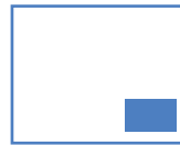
Business Card (3.5" x 2") Landscape