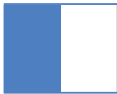
Half Page Ad (5.5" x 8.5") Portrait